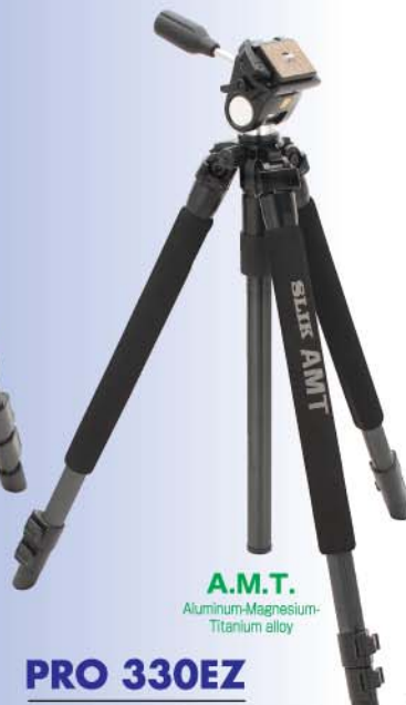
A.M.T. Aluminum-Magnesium-Titanium alloy