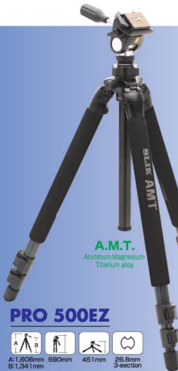
A.M.T. Aluminum-Magnesium-Titanium alloy

Dual Axis Bubble Level Camera mounting screw U1/4 Tripod mounting screw U1/4 Height 81mm Width 76mm Depth 188mm Weight 470g